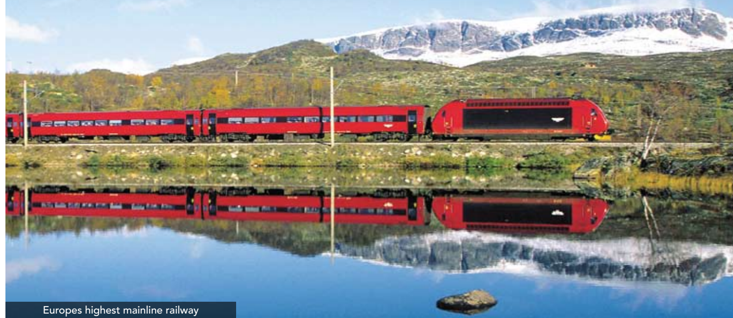
Europes highest mainline railway

This popular extension, which can be combined with many of our itineraries, takes in one of Europe's most breathtaking rail journeys, crossing the high plateau of the Hardangervidda, across the roof of Norway to the lush landscapes of the western fjords.